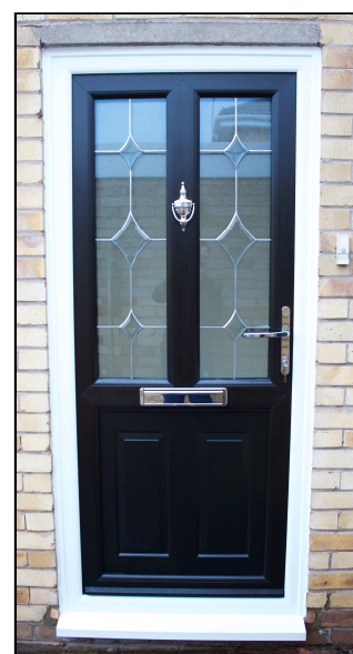
Example flood door

It is not always possible to install a structural flood defence or implement flood mitigation measures to protect homes and businesses etc., from flooding, due to economic or practical reasons. Therefore, in some cases, property owners have had to utilise other means to reduce the risk of water entering into their property. Manufacturers have developed products that, when fitted to a home or business, can increase the properties ability to cope with, or be more 'resistant' or 'resilient' to flooding. PLP consists of a range of flood resilience and flood resistant measures designed to limit water entry into the property and make the process of getting back into a home following a flood quicker.