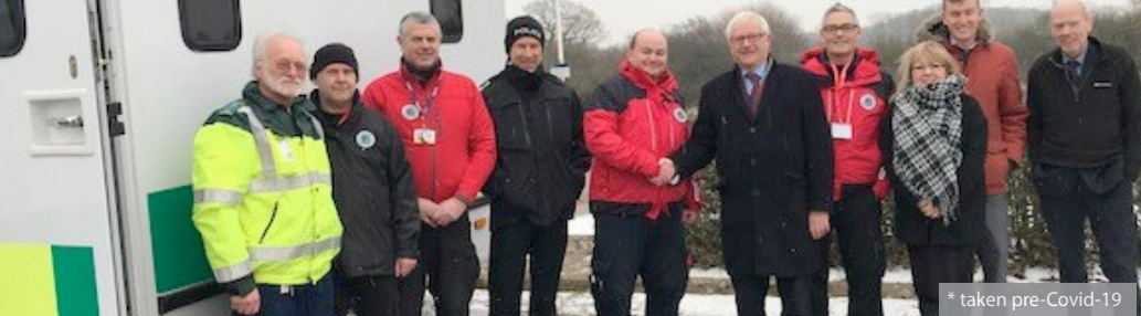
* taken pre-Covid-19

The Commissioner's total net budget requirement for 2021-22 has been set at £212.572m. This equates to an increase of £12.709m (6.4%) from the 2020-21 net budget requirement level of £199.863m.