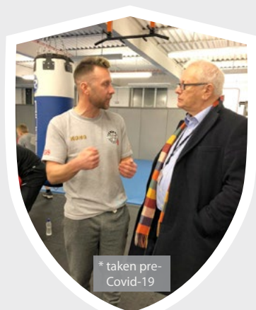
* taken pre-Covid-19